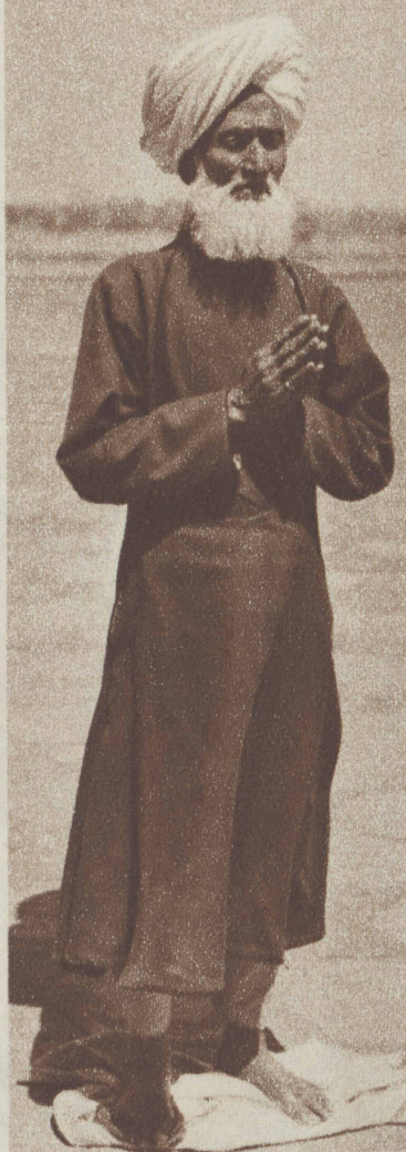
MOSLEM DEVOTIONS — A barefoot priest of the cele- brated Taj Mahal, at Agra, India, recites his prayers.

12-Cylinder Performance as smooth as the Zephyr's ride on the rails!