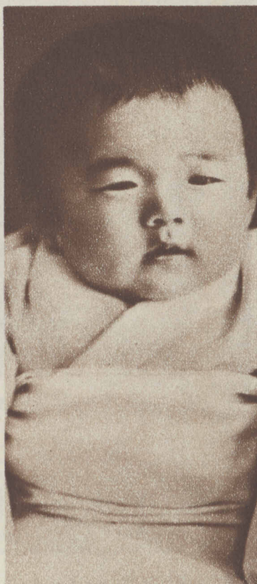
A ROYAL BABY OF JAPAN— Six month old Prince Masahito Yoshi, second son of the emperor.

TRAVEL, by road and by rail, has come a long way in a matter of months. In the fleet, streamlined Zephyr train, and in the new, authentically modern LINCOLN-ZEPHYR, is a wholly new conception of transportation! Each is full of new ideas of design, performance, economy of operation. Each is, in its field, the pattern for the future!