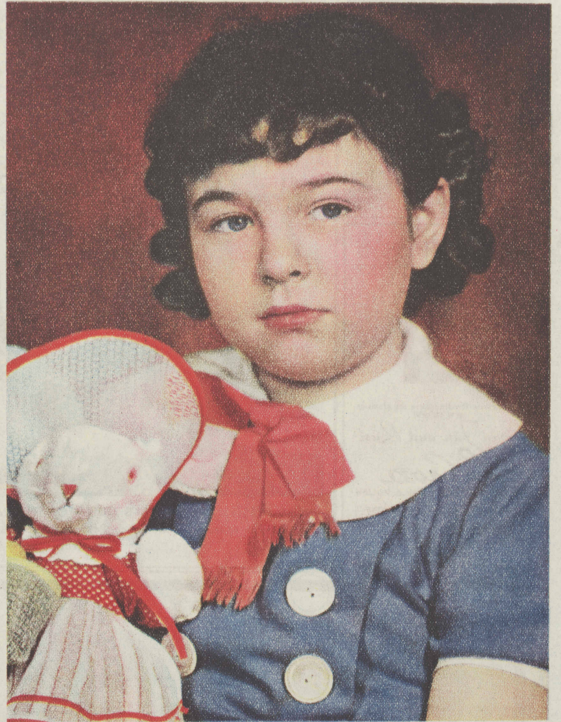
JANE WITHERS, first cast as a brat in a Shirley Temple picture, then starred in her own right. Versatile Jane sings, tap dances, does imitations, rides, swims, and skates.