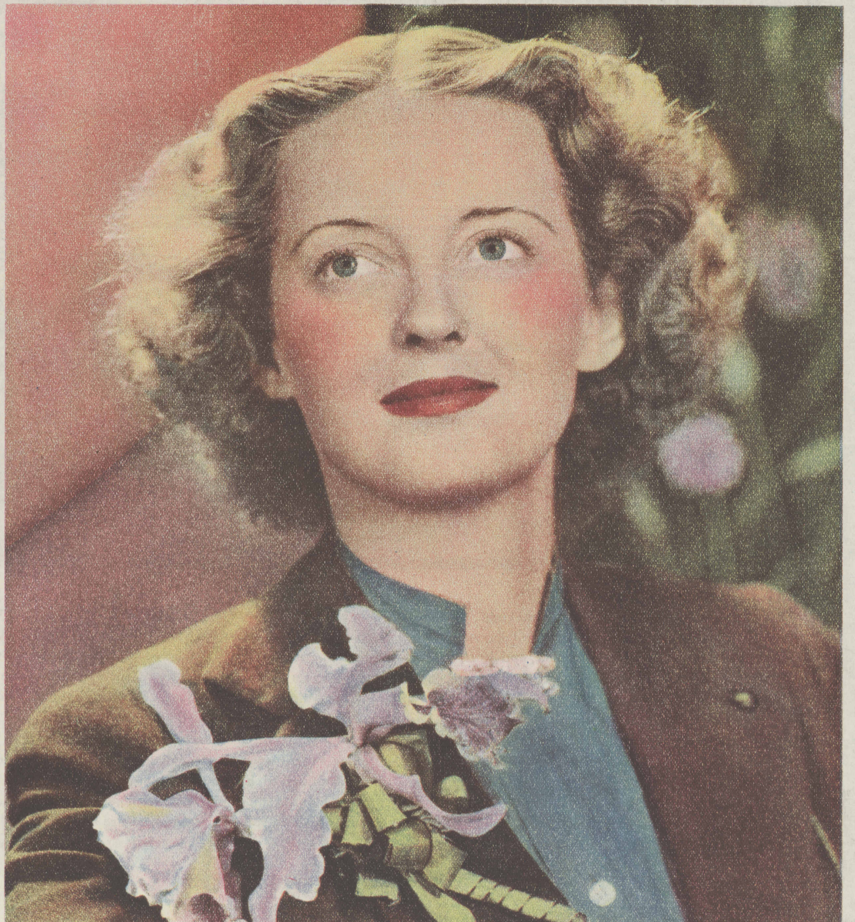
BETTE DAVIS (at right) won the 1935 award of the Academy of Motion Picture Arts and Sciences for her work in "Dangerous."

COPIES OF THESE PICTURES, IN THE SIZES AND COLORS SHOWN AND FRAMED UNDER GLASS, CAN BE OBTAINED AT THE CHICAGO TRIBUNE PUBLIC SERVICE OFFICES, TRIBUNE TOWER AND 1 SOUTH DEARBORN STREET. PRICE: EACH, 40 CENTS; BY POSTPAID MAIL 50 CENTS (DO NOT SEND COIN OR CURRENCY.)