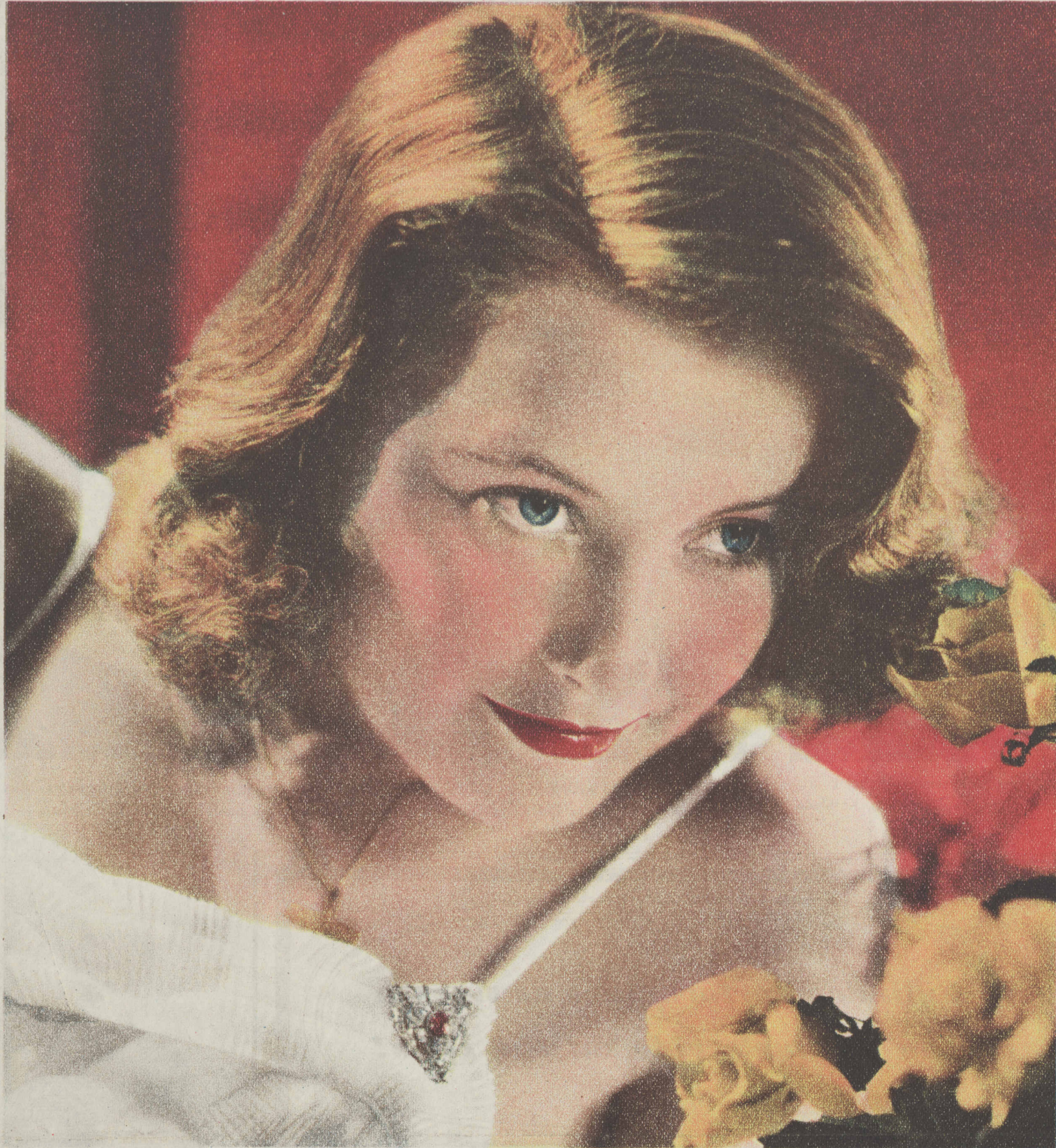
BARBARA STANWYCK, who first wanted to be a dancer, and then a missionary to China, but eventually found herself in Hollywood. In her most recent picture, "A Message to Garcia," she plays opposite John Boles.