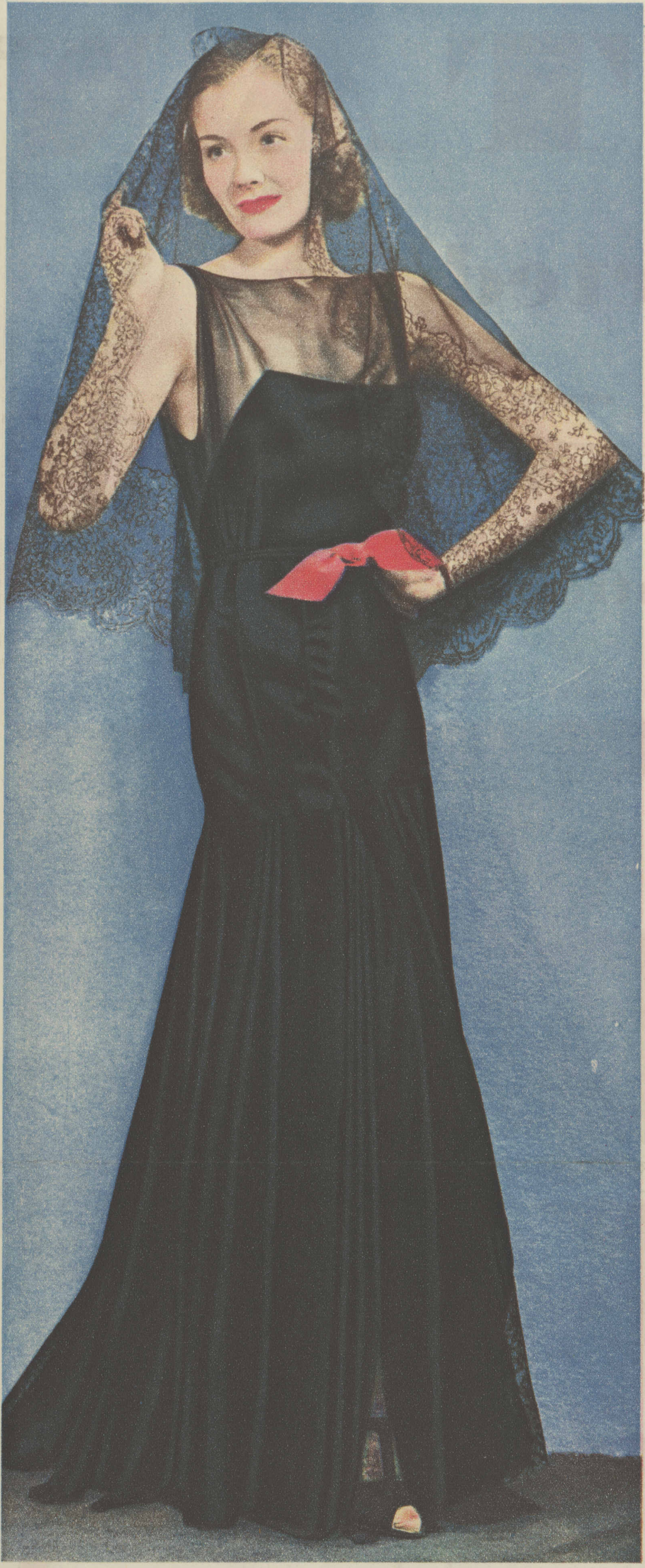
Fragile black lace and chiffon are combined in the fitted dinner and dance dress above, by Paquin of Paris. A vivid splash of color appears in the bow tied belt. A shoulder scarf of black also is banded in the lace.