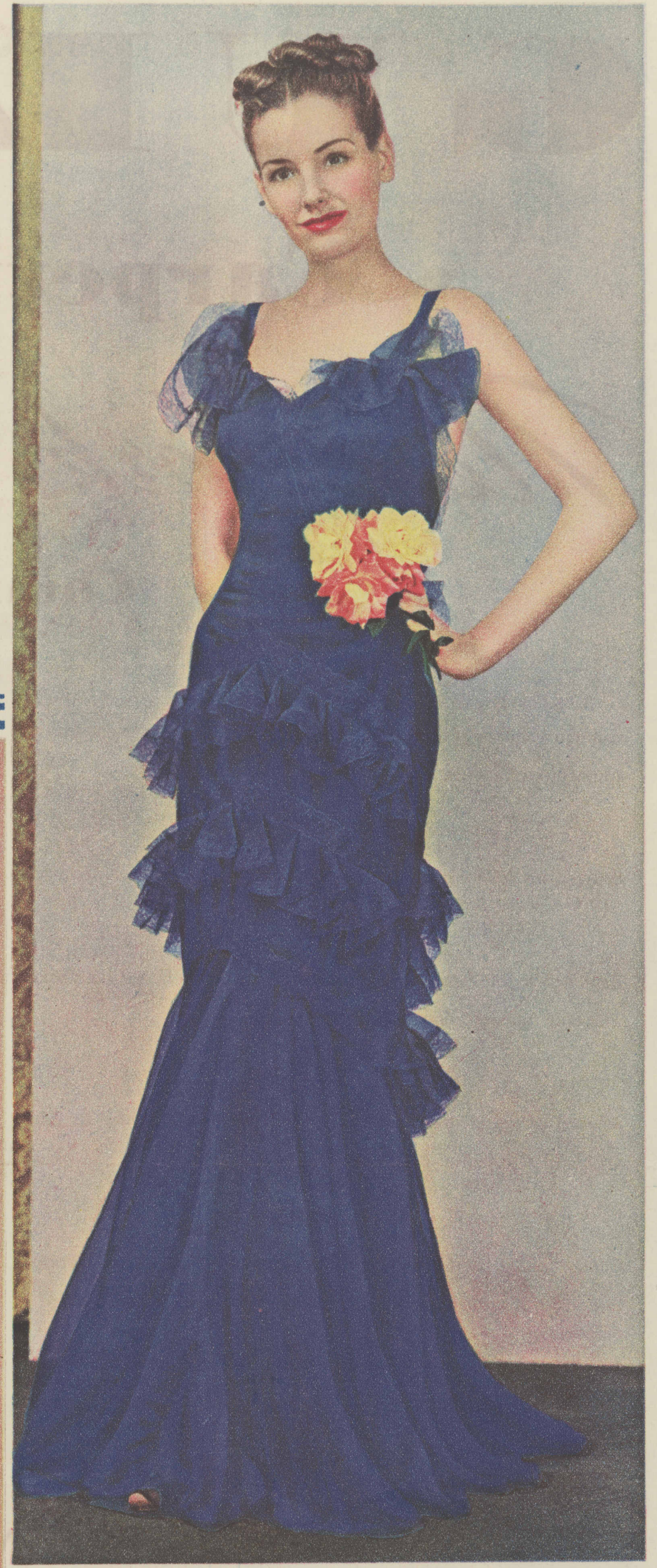
Ruffles trim the midnight blue lace and chiffon evening gown above, designed by Patou. It features a clinging streamline with a deep knee flounce.