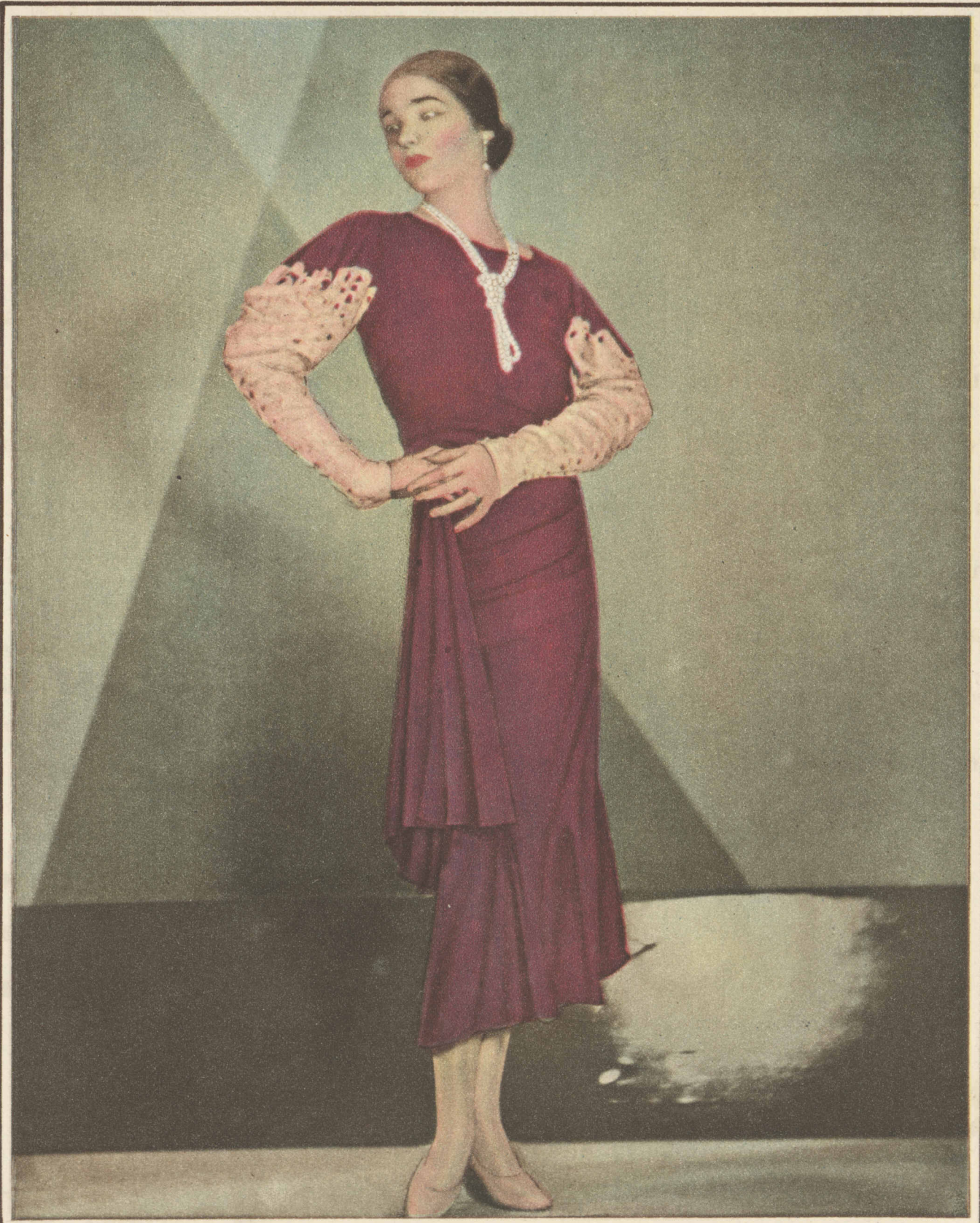
GENUINE LEG O' MUTTON SLEEVES! In moderate sizes, they are another revival of the fall. Madeleine introduces them in this afternoon dress of amaranth red silk crepe, and makes most of the sleeve of creme lace. Necklace and earrings worn with the costume here are pearl.