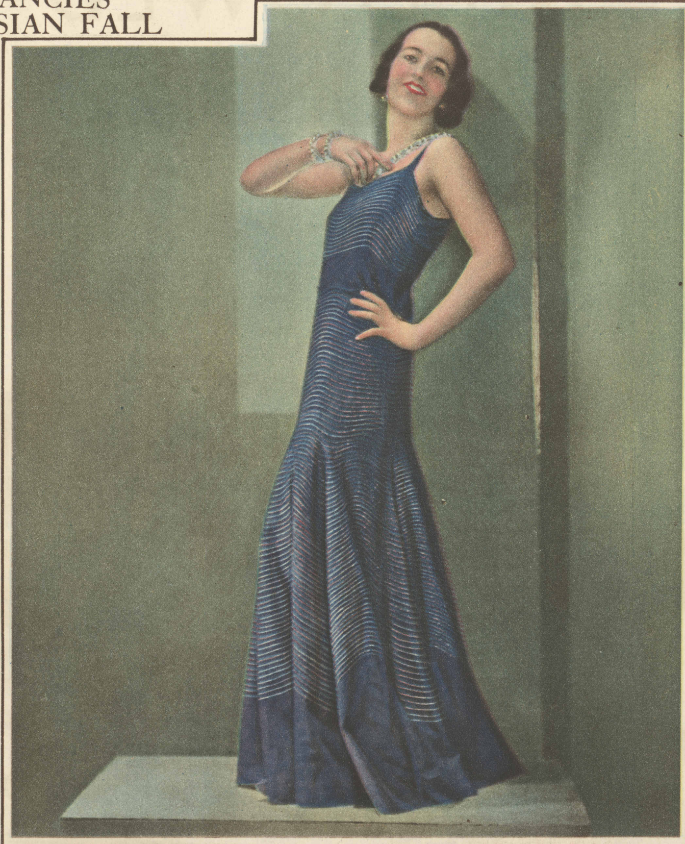
THE BEADED EVENING GOWN IS ONE OF FASHION'S DARLINGS —And Lelong expresses the vogue in this blue net creation, embroidered all over with wavy lines of silver beads, thus making use of a combination which is both new and novel. The necklace and bracelet worn with it here are of white crystal.