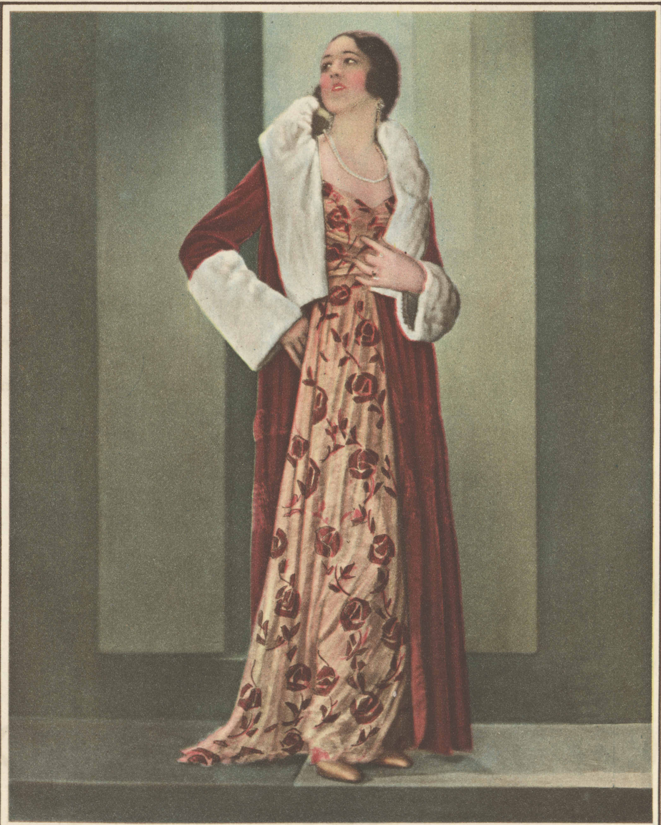
INTRODUCING MOLYNEUX' NEW REVOLUTION SILHOUETTE —Of gold and red metal chiffon, the dress has an Empire waist and a long skirt that is shirred at the top. The red velvet coat hangs loose from a mother-hubbard yoke and has ermine collar and cuffs. Earrings and rings worn with it here are garnet.