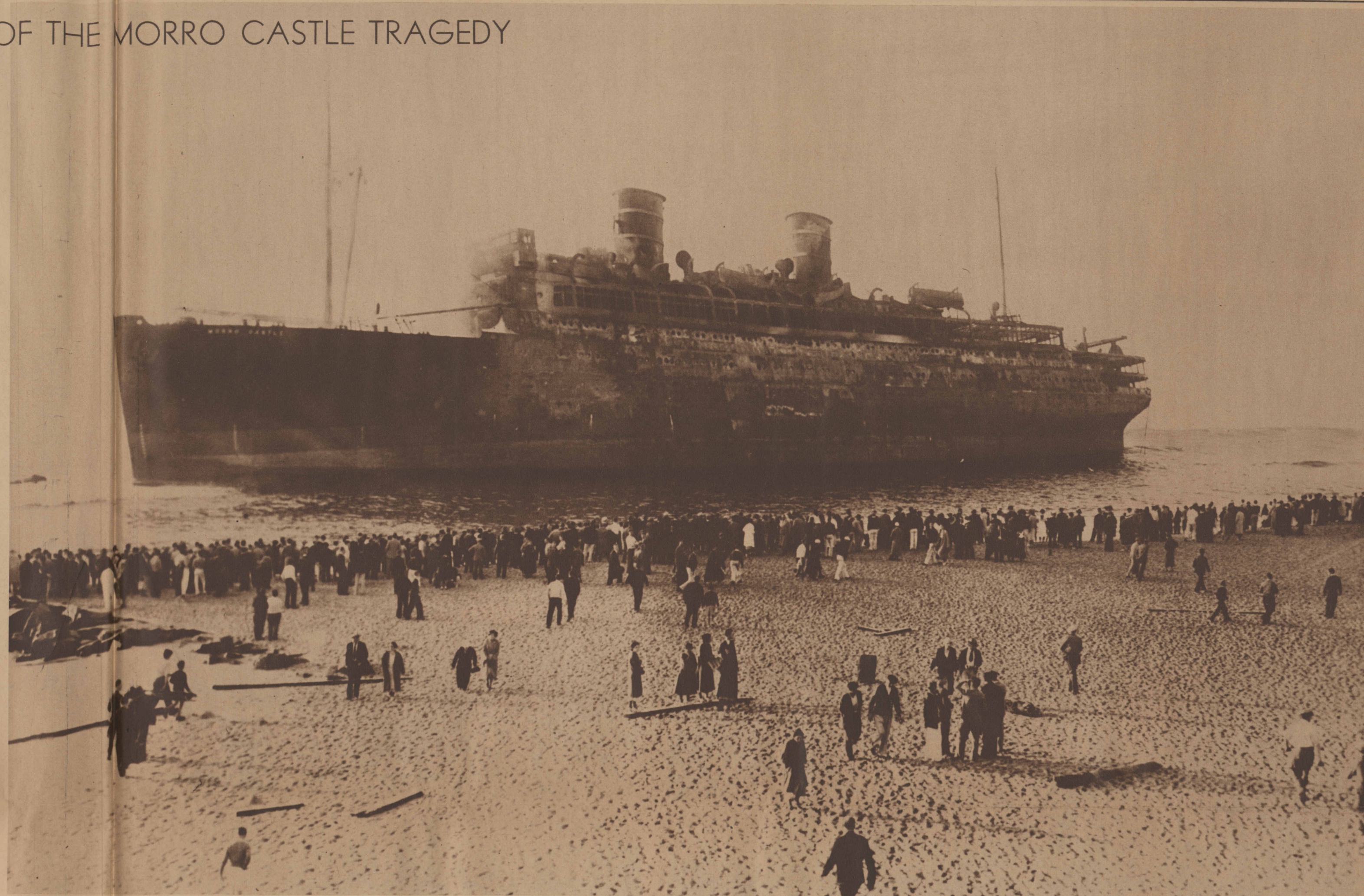
BEACHED—Crowds gathering at the Jersey shore where lay the death-laden Morro Castle, still being swept by flames which denied access to the bodies of victims.

ADVANCE Paris Colors WILL MAKE LAST SEASON'S FROCK THIS SEASON'S SENSATION