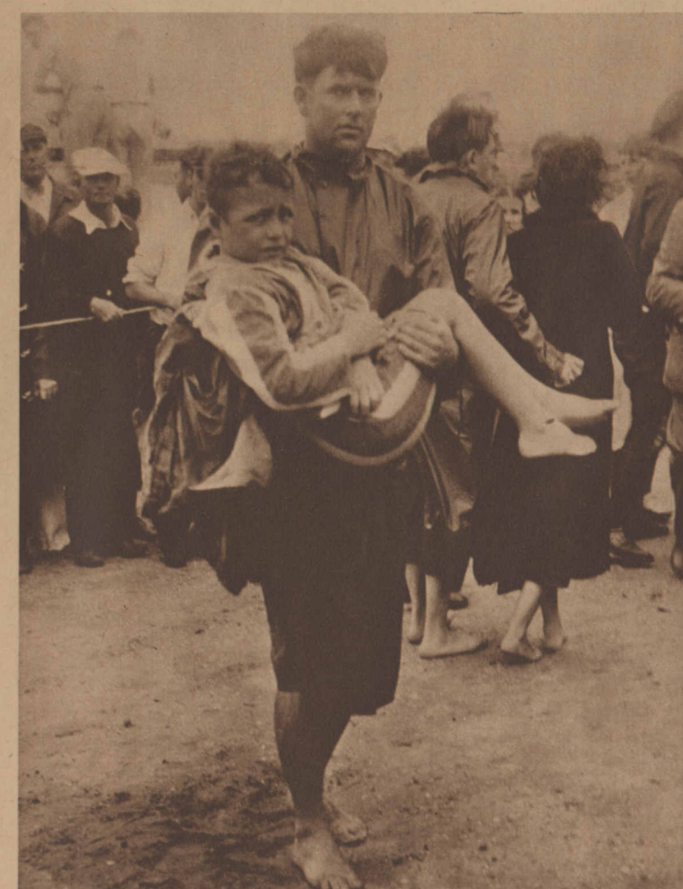
A YOUNG SURVIVOR, brought to shore in a lifeboat, being taken to a hospital at Manasquan, N. J.

Name _____ Address _____ City _____ State _____ (If name unobtainable, please do not send copy.)