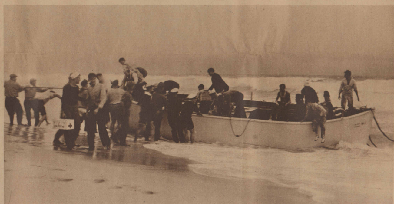
A MORRO CASTLE LIFEBOAT brings survivors through the surf.