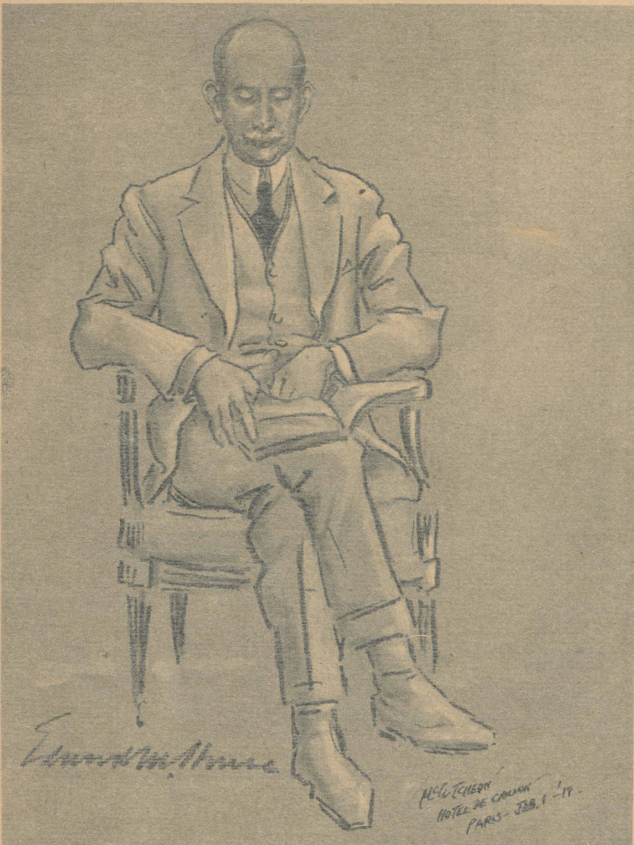
COL. E. M. HOUSE , drawn from life by John T. McCutcheon. Mr. McCutcheon writes concerning this sketch: "He was a patient and forgiving subject and made the artist feel at ease when the moment of showing the sketch arrived. Col. and Mrs. House live at the Hotel de Crillon, where the other American peace delegates also have their temporary homes. Col. House has just emerged from a long and severe attack of influenza and it seemed an imposition to inflict upon him the ordeal of sitting for a sketch. But he went through the ordeal with fortitude and greeted the finished sketch with finished diplomacy and kindness."