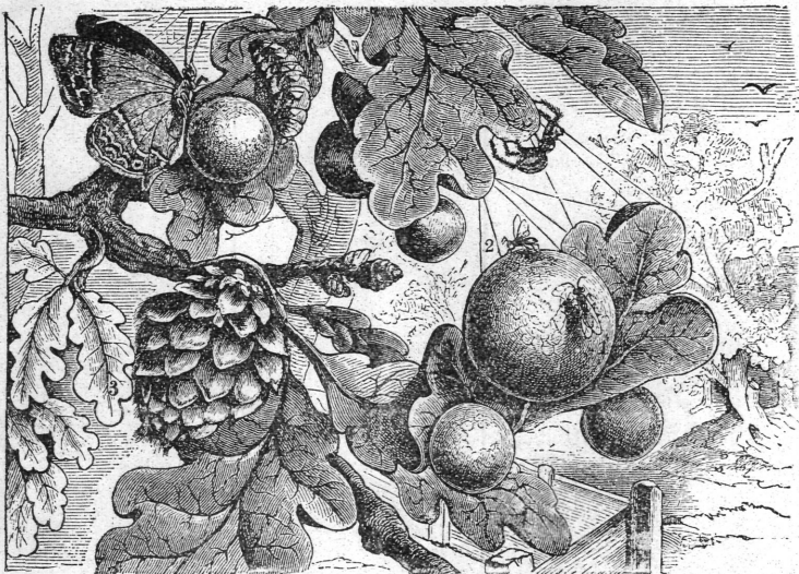
SOME COMMON OAK GALLS OR OAK APPLES.

The use of this power or habit is quite apparent; the galls being very delicate and fragile would stand a poor chance if left on the surface of