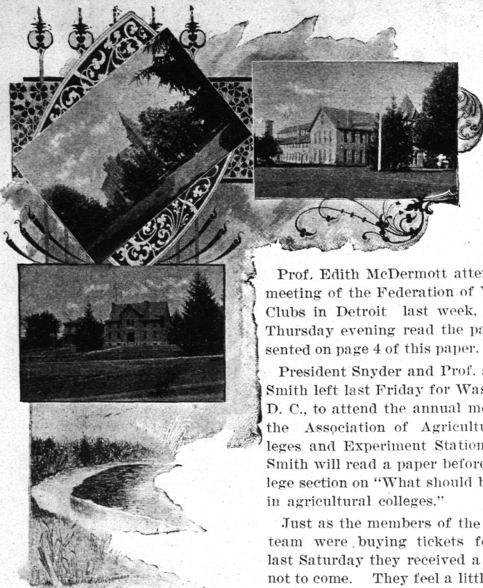
At the College.