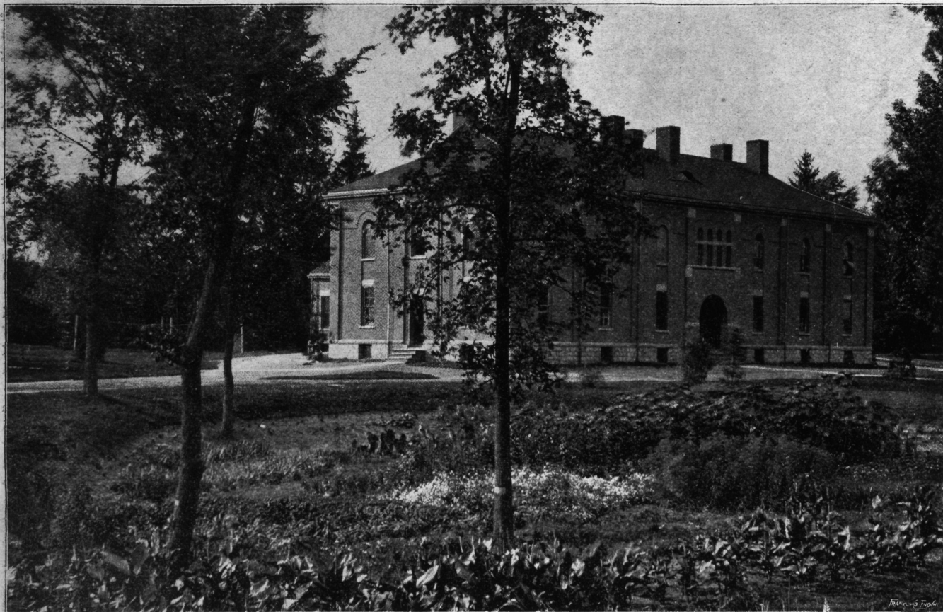
ABBOT HALL AND RAVINE FLOWER GARDEN.