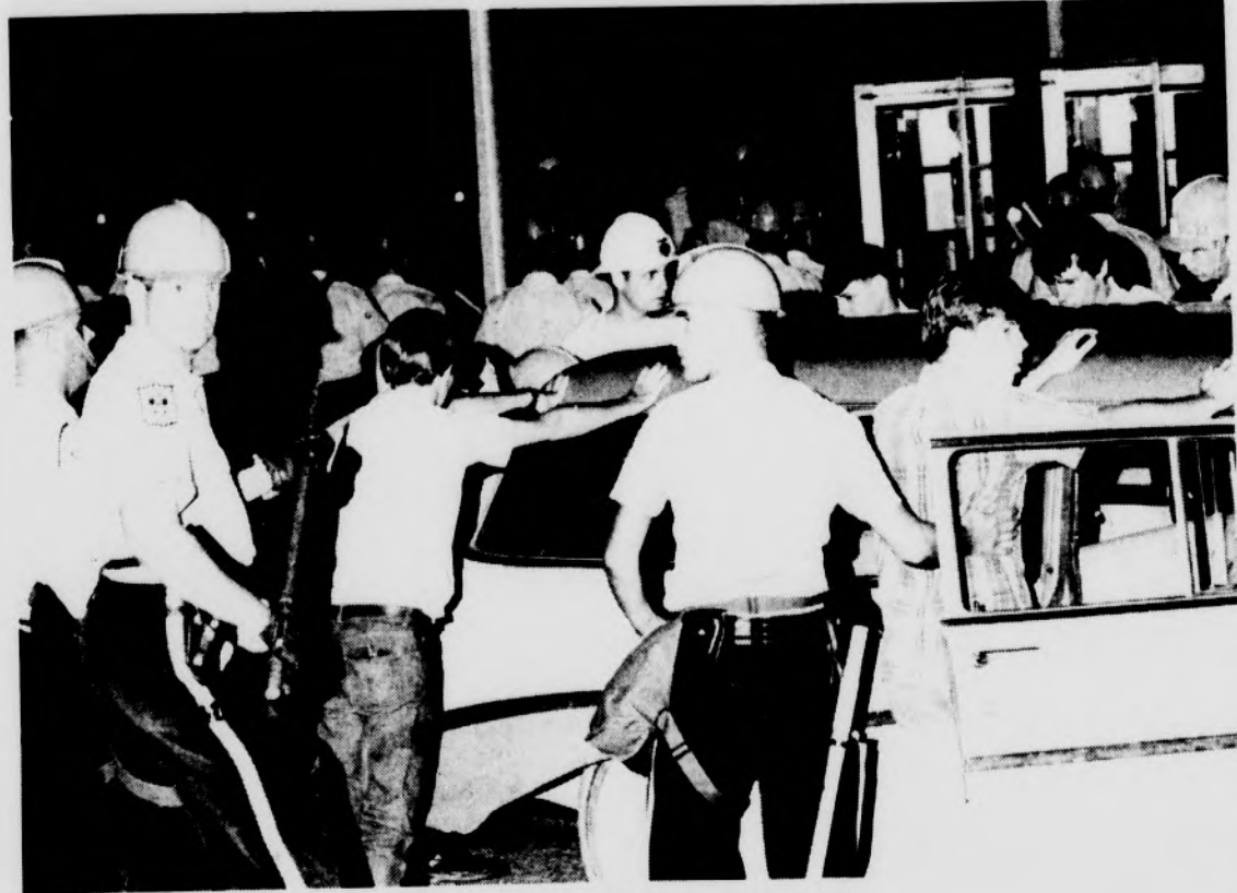
Carry Riot Sticks

Kalamazoo-Butler intersection was the scene of mass Negro demonstrations during the past few nights. Many white youths who entered the "combat zone" were stopped and questioned by police. Here, two such persons are placed under arrest for carrying three lead filled riot sticks under the seat of their car.