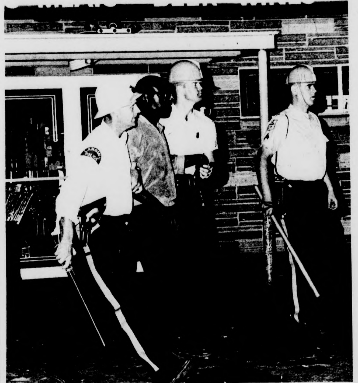
A Police Escort

The plane landed safely, Izvestia said. It added that police are investigating the affair.