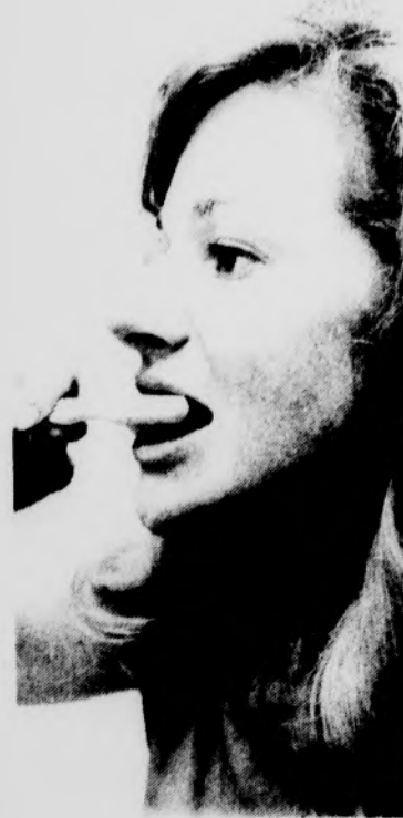
What It Is