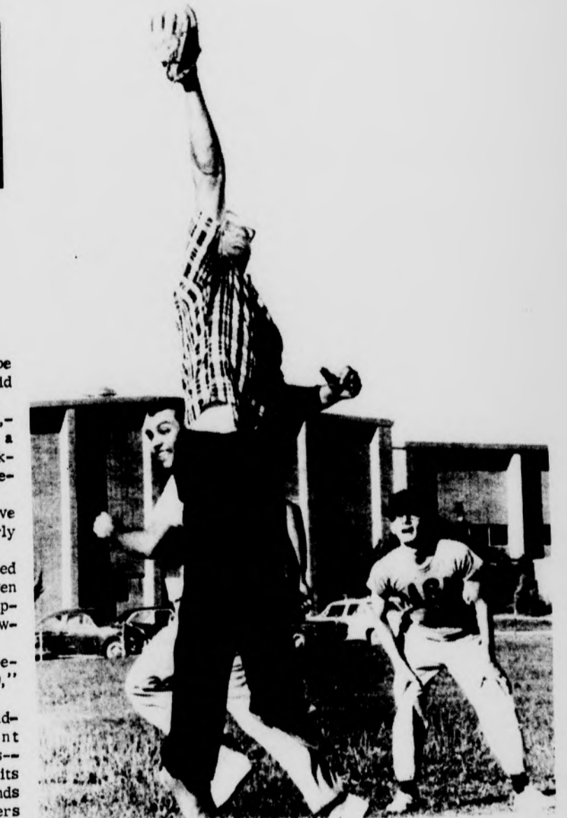
The Long Reach

Independent television, which had exclusive rights to the post-fight films in Britain did not have any success either when the film was screened 24 hours after the fight.