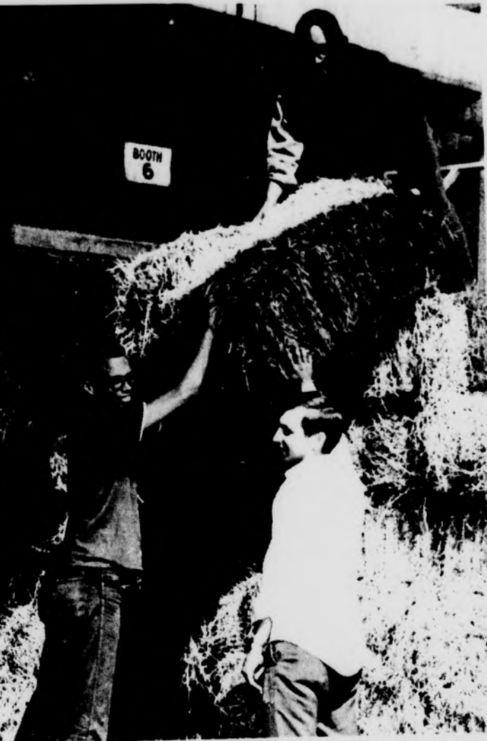
Preparing For 4-H