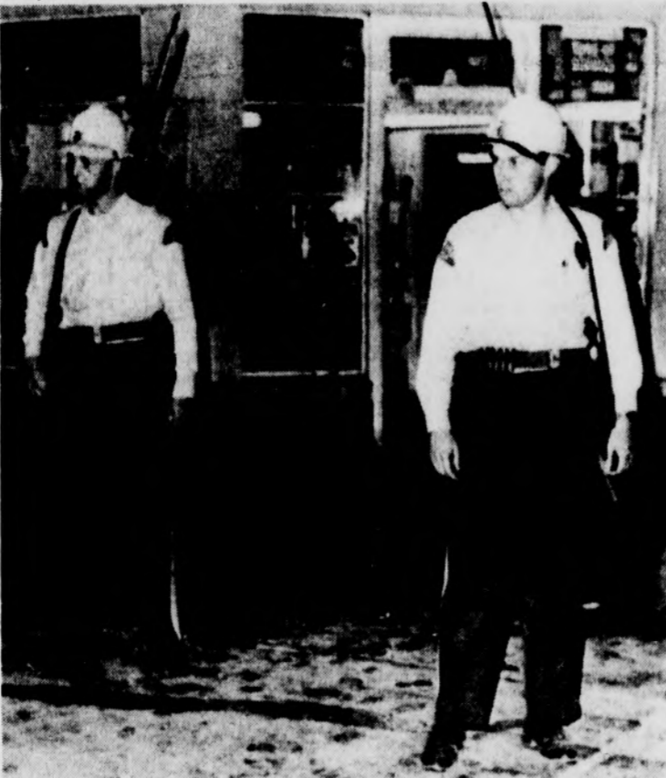
Police Stand Watch

BULLETIN LANSING -- Rioting in Lansing broke out again Monday night as groups of young persons, mostly Negroes, threw bottles and rocks on the city's west side. The most serious rioting at 10:30 p.m. was reported near Sully's Drive-in Waverly Rd. at Saginaw. Damage to a nearby shopping center was reported extensive. Police cordoned off several blocks in the area where small groups of from 15 to 25 youths were throwing rocks and bottles. By BOBBY SODEN State News Staff Writer Five youths appeared in municipal court Monday after being