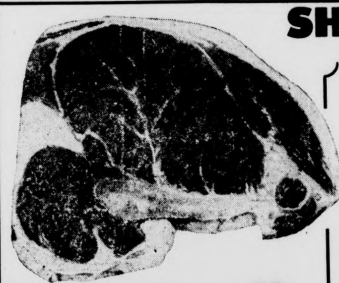
Fresh Mushrooms . . . LB. 59¢