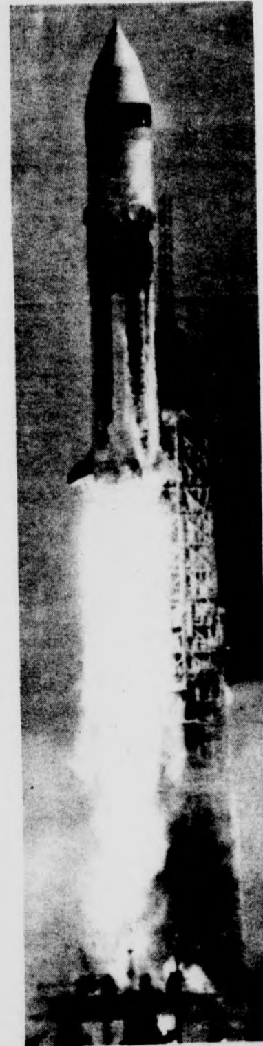
LIFT-OFF—Up shoots the Saturn rocket carrying the world's heaviest satellite which weighs 29 tons.

The Beatles had maintained the bungled presidential luncheon Monday was not their fault and apologized for standing up the first lady.