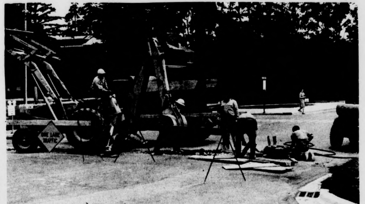
CONSTRUCTION OR OBSTRUCTION--Once again, workers are tearing up part of West Circle Drive. The work disrupted traffic most of the day.