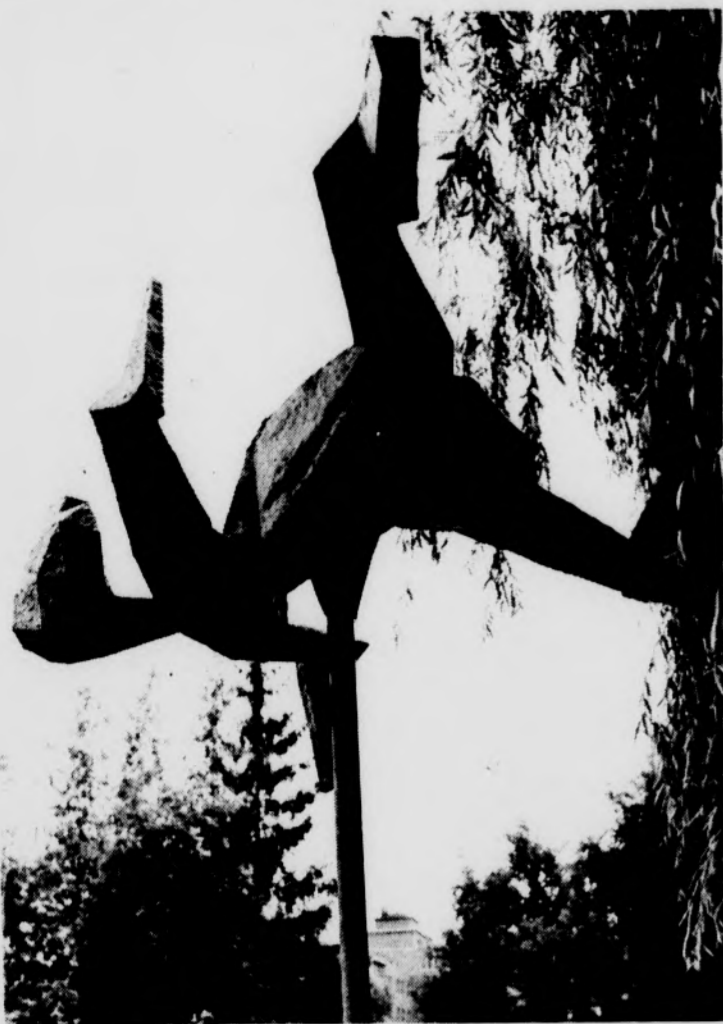
STONE POLESITTER?—This creation is the newest addition to the Kresge Art Center. If you set this picture on its side, the stone resembles a high-stepping dinosaur.