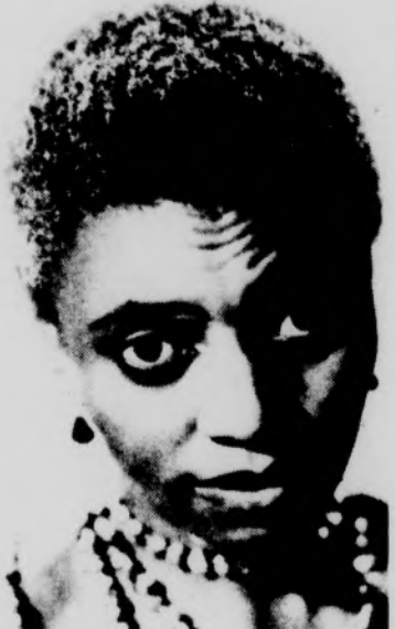
MAKEBA HERE—Noted African singer Miriam Makeba performs in the University Auditorium tonight at 8:15 as a part of the Spring Lecture Concert series.

Some of the students have asked a Lansing attorney to fight the case for them. They asked anyone involved to call 353-0445 or 353-0444.