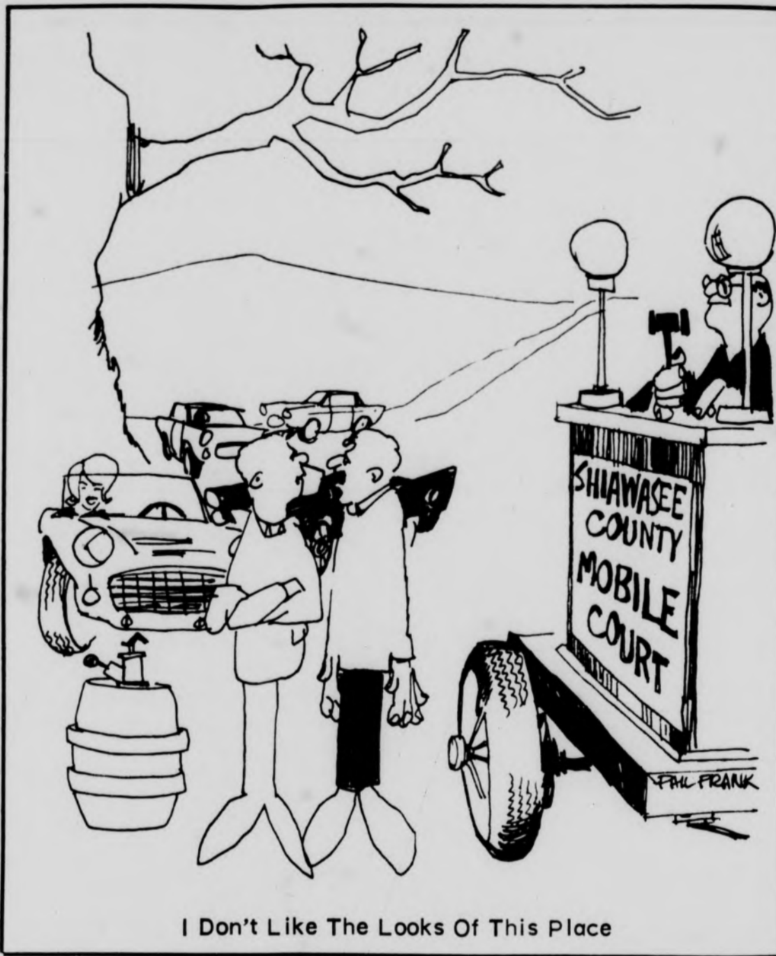
I Don't Like The Looks Of This Place