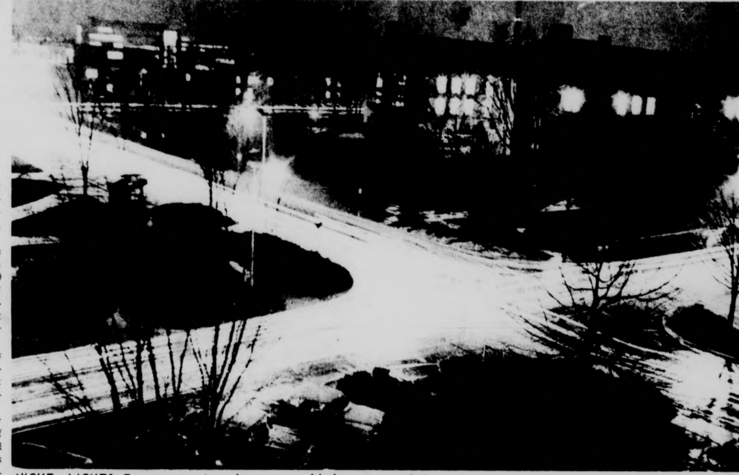
NIGHT LIGHTS--Passing cars form this pattern of lights on East Circle Drive near the Natural Science Building as

Approximately 200 student lea- gan Secretary of State; Jack