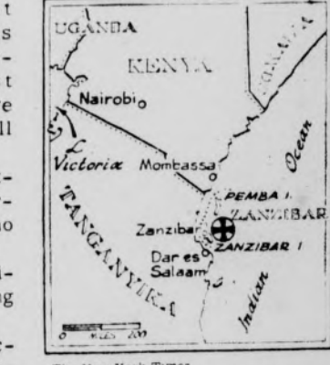
The New York Time: Cross denotes Zanzibar

serve the progress of the peacemaking operation" and report on the words of the kings and queens. R, through February, while The dramatic revue is set to studying the prospects for future observation.