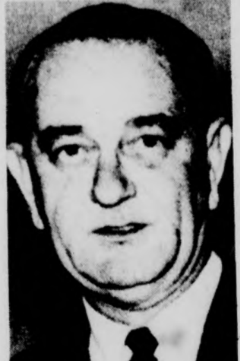
LYNDON B. JOHNSON