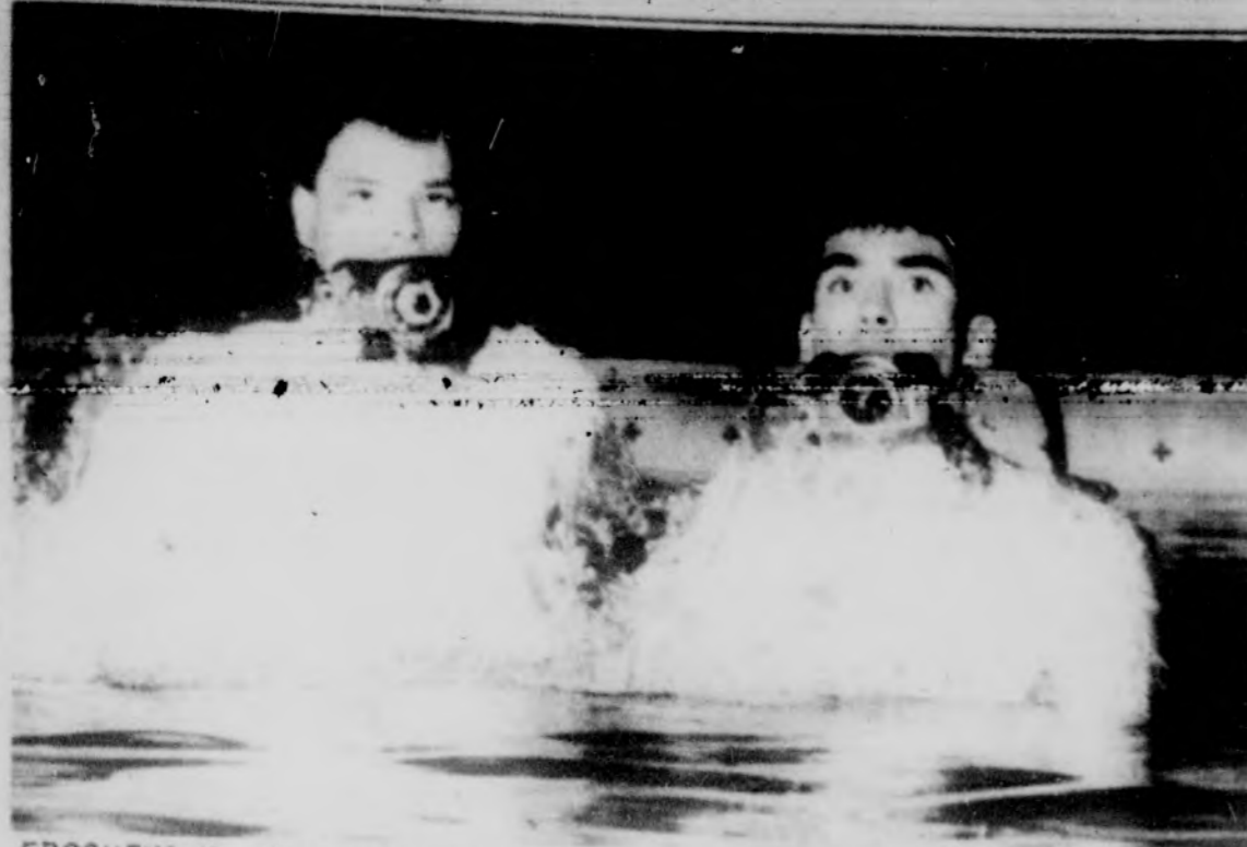
FROGMEN?—No, these instructors are demonstrating part of the training which selected ROTC cadets will go through in the new Counterguerrilla Warfare Company.