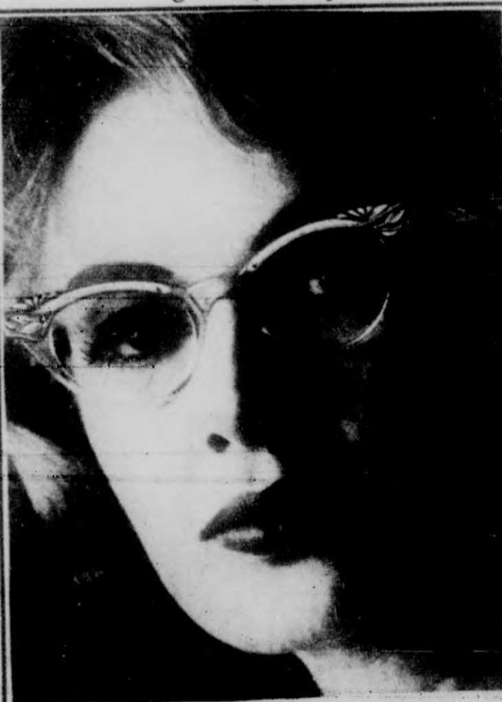
regal eyewear beauty

Rythm and Blues Rock and Roll $2.39 per LP DISC SHOP, OPEN EVENINGS