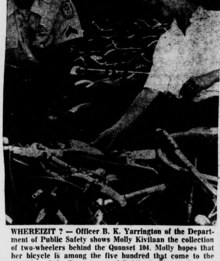
attention of the Department of Public Service each year.

A combination of graduated puesdo pearls; red, green, or brown chunky baroque stones plus shinny textured gold shells add up to an accentmust for fall costumes. 1-strand necklace. 4.00 2-strand necklace. 7.50 3-strand necklace. 12.50 2-strand long necklace. 12.50 Matching cluster earrings. 4.00. and 5.00 prices plus tax