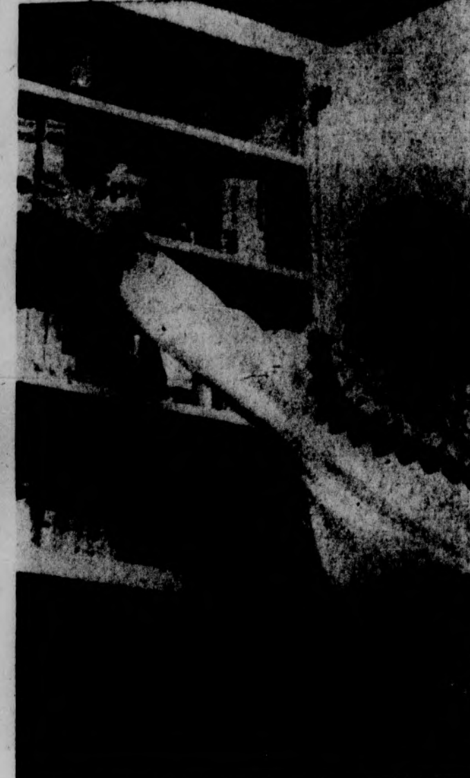
HOME MANAGEMENT GIRLS take their turn at performing various household tasks.