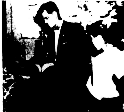
Gov. G. Mennen Williams today watches tabulations of election returns on the teletype machine in the governor's mansion.

Occupying Most of Suez Area GENEVA (Wednesday)—British and French forces today have effectively controlled the Suez Canal today, according to a cease-fire. The deadline they set for the signature of an armistice is the point on the horizon. The time was 11:30 p.m. Tuesday.