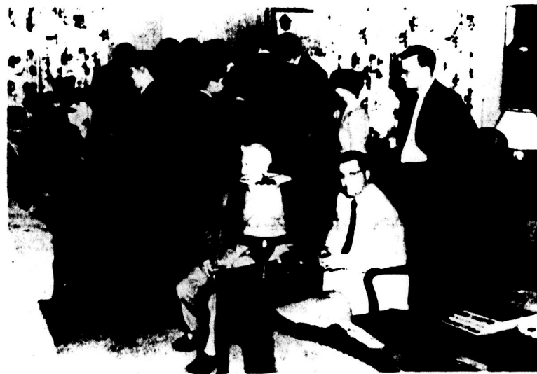
Friends and well-wishers gathered around television and teletype machines in the governor's mansion early today as election results started to pour in from all over the nation.

LONDON (AP)—Soviet Defense Minister Zhukov says the Soviet Union is prepared to take what he termed "a real part with armed forces in the liquidation" of the British, French, Israeli invasion of Egypt if the United Nations orders such intervention.