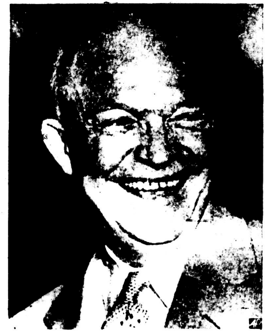
PRESIDENT EISENHOWER ... "a vote of confidence" ...

SEATS AT STAKE: Republicans 203 Democrats 232 SEATS WON: Republicans 126 Democrats 173 Undecided 136