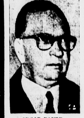
EDGAR FAURE lost confidence

PARIS (AP) — Premier Edgar Faure lost a confidence vote in the National Assembly Tuesday night. But instead of resigning, as is customary, his cabinet is considering dissolving the Assembly. This would make new elections necessary. A final decision on resignation was put over until Wednesday evening. Unofficial reports following a meeting of Faure's ministers Tuesday night indicated a majority favored dissolution.