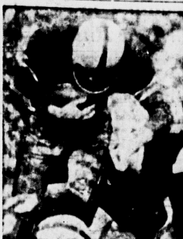
HOPALONG CASSADY he crushed E. of M. hopes.

Now the responsibility of keeping alive the era rests on basketball, track, boxing, wrestling, swimming and hockey. And we can't forget the tennis and gymnasts. Possibly the hockey team gave us an indication of what is to come by winning two of three in the East. At any rate it's been a good season and one that can't be topped by any school.