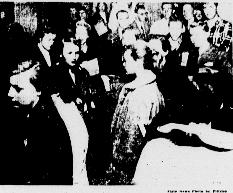
Spartan Special Opens Wide for Students