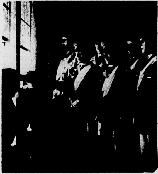
Seaboard and Blade initiates coax coeds to rise and shine 6:30 a.m.

3 Barbers to Serve You... at the SPARTAN BARBER SHOP