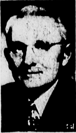
Dale Carnegie author of "How to Win Friends and Influence People" died Nov. 1 in his New York home after a long illness. He was 66.