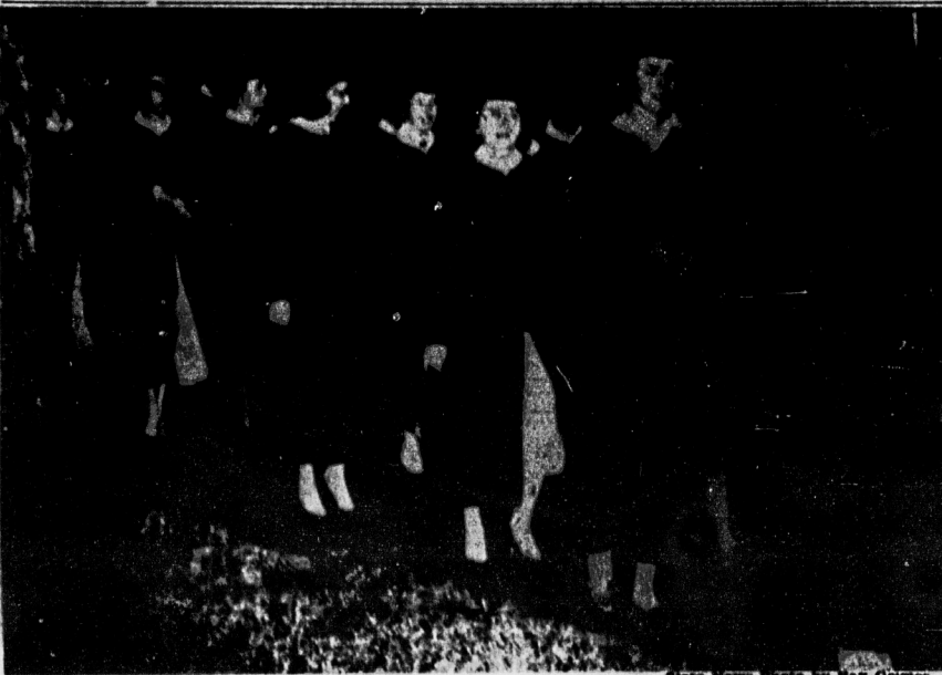
Smiling seniors parade in the "Senior Swingout."

Films include: "ToyMaker," "The Locks of Saul Ste. Marie," "Wildlife and the Human Touch," and "Animals Unlimited."