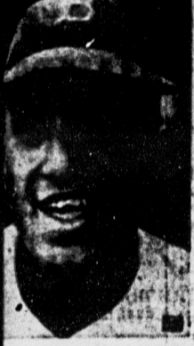
DON NEWCOMBE after suspension

Baker's clean single in the fifth was the only hit off New-