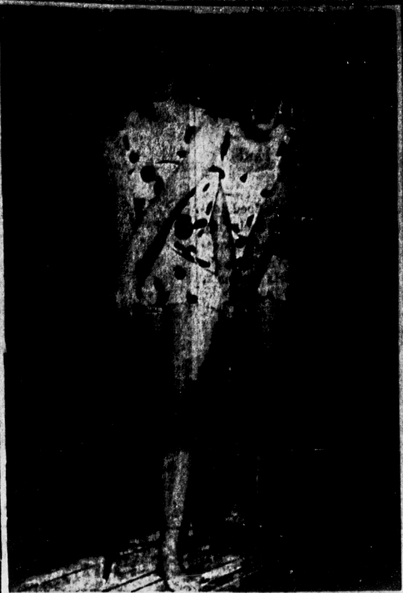
... "The Dot Sisters" ...