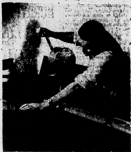
BEGINNING TOUCHES . . .

... Travel Office ... West Grand River ... Phone ED 7-9747