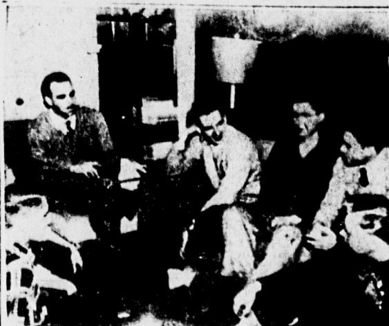
Members of Bethel Manor take part in a religious discussion led by a team of college graduates.

More than half the Americans live in rural areas.