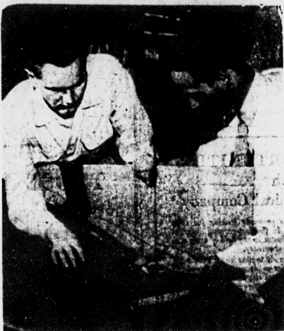
... AND FINAL STEPS IN DESIGNING BOXES