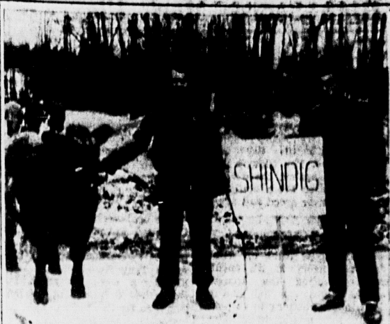
Babe, the blue ox, is helping members of the Forestry Club advertise the Shindig.