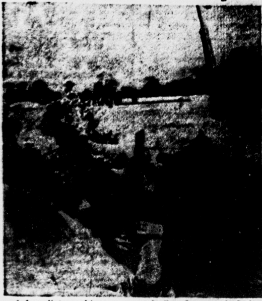
A Loyalist machine gun guards San Jose, capital city of Costa Rica.