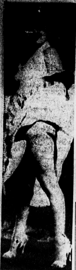
MARILYN MONROE ... back in circulation ...