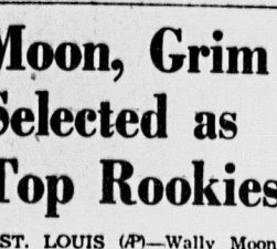
WALLY MOON ... selected as top rookie