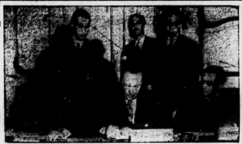
British Foreign Secretary Anthony Eden (seated, left) and French Premier Pierre Mendes-France (seated, right) watch as West German Chancellor Konrad Adenauer affixes his signature to agreements in London whereby West Germany comes into the North Atlantic Treaty Organization as its 15th member.

College switchboard operators say "Michigan State" over 4,000 times a day as they handle the campus incoming and outgoing phone calls.