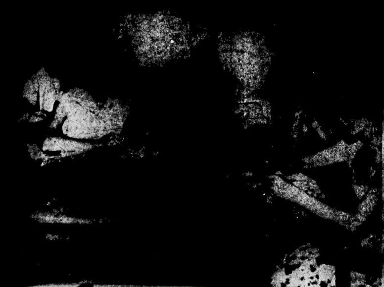
In Journalism Workshops