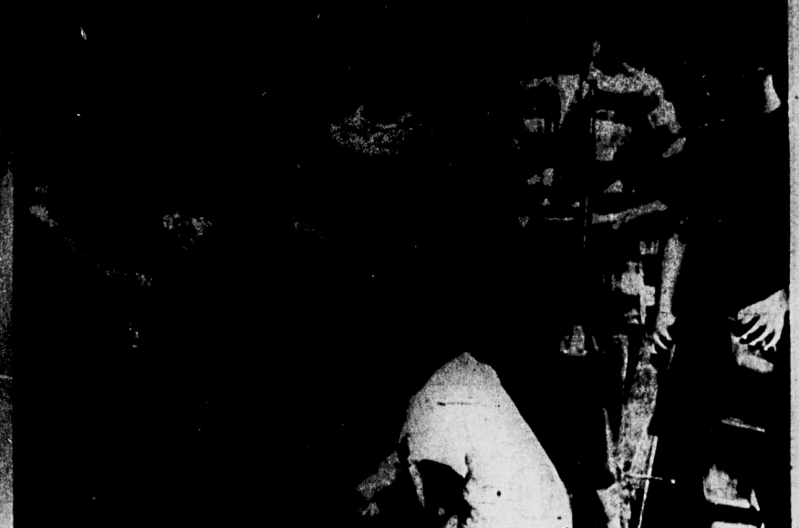
And in Music Practice