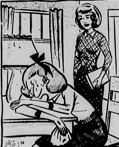
"Worthal and I broke up—I got a 'C' average this term and he said he just couldn't go with a girl smarter than he was."