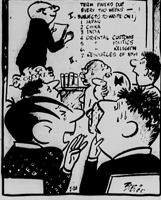
"Looks like we'll be writing research papers all term - I understand Prof. Snarf is writing a book on the orient."