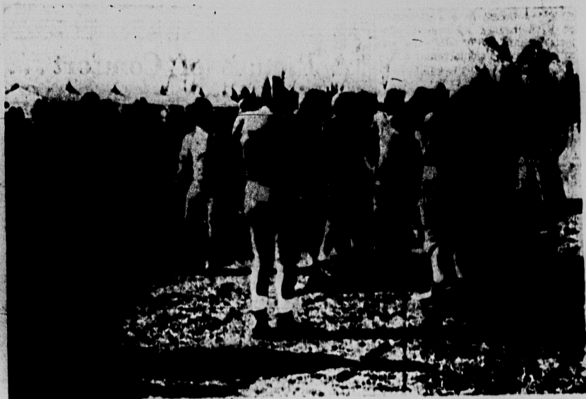
Head Football Coach Duffy Daugherty welcomes his players as they opened their spring drills Monday. It was the first of 20 drills.