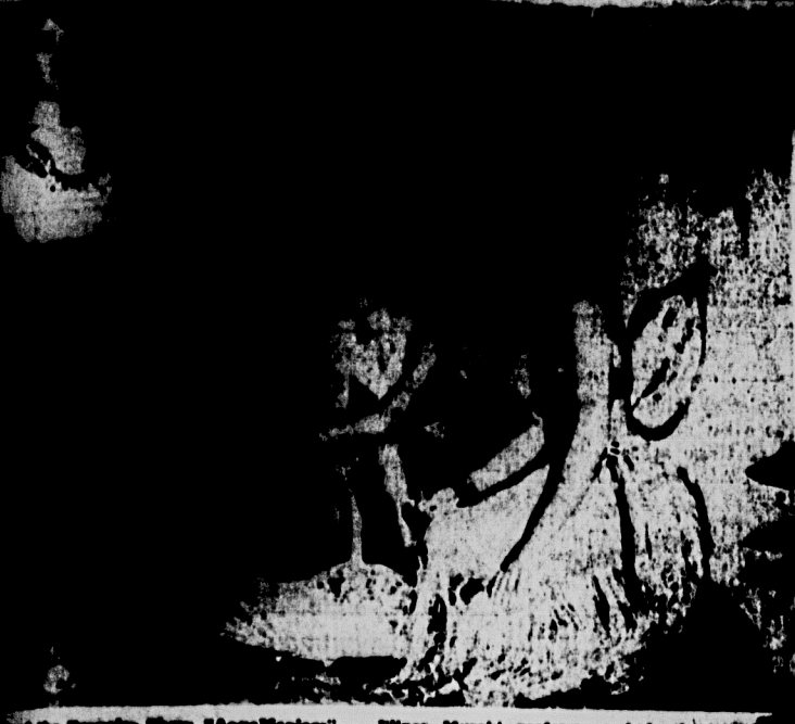
Of the Purpose Show, "Aqua-Mania", Elinor Muraki performs a hole dance, while two others in the show look on.