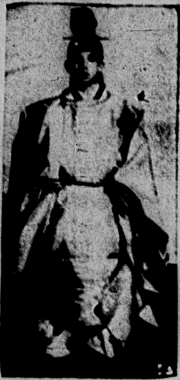
Crown Prince Akihito, 18 son of the Emperor of Japan, leaves formal ceremonies in which he was officially declared heir apparent to the Japanese throne. He is wearing centuries-old ceremonial robes and a coronet signifying his new position. The ceremony took place at the Imperial Palace in Tokyo.