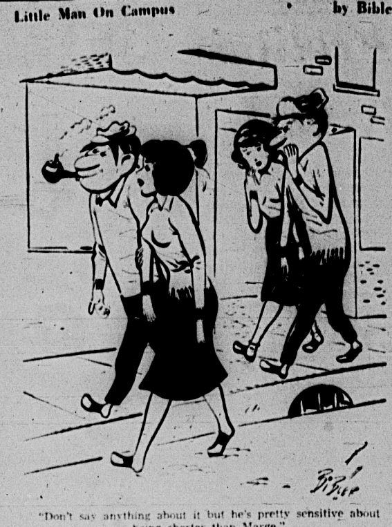
Little Man On Campus by Bible. "Don't say anything about it but he's pretty sensitive about being shorter than Marge."

relish it. He never waits for a fight to come to him. He goes out and looks for it. He may, however, have gotten in a bit deeper than he figured when, at the beginning of the new congress, he decided to try to seize party leadership in congress on foreign policy as well as domestic policy.