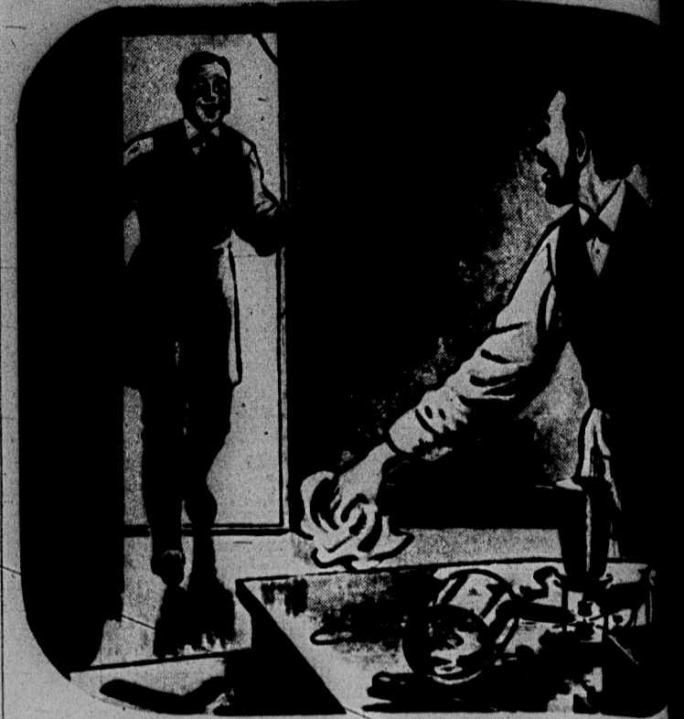
"Mr. Bell, I heard every word you said — distinctly."