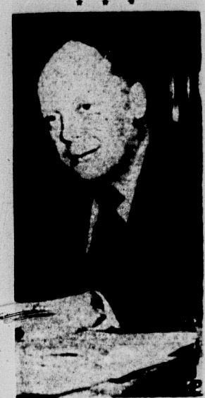
REP. KARL MUNDT

They carried signs reading "Defeat the Mundt Bill," "Pass the Anti-Lynching Bill, the FEPC"