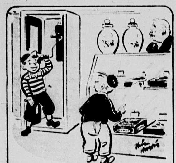
“Oscar! Get the Dentyne Chewing Gum—it's a date!”

Rush Calls Every day the department averages four or five calls on locked files, doors, etc. The office staff they answered a rush call from Phillips-Stevler hall. One of the men had gone to take a shower, locking himself out of his room, and his roommate locked in. Neither had a key. Lost and found keys are replaced at the rate of about 500 each month.