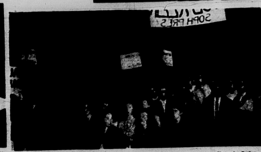
Loyal supporters for candidates for class officers gather in an all-college election rally by the Women's gym last Wednesday night, the day before the primaries.