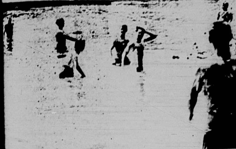
The annual Frosh-Soph class day activities held last Saturday in various parts of the campus were their usual riotous success, as these photos show. Above left, the battle gets off to a good start as members of both classes start the pushball fight in front of Dem. hall. Above, the greased pig contest, which resulted in a draw in favor of the pigs, provides plenty of action as the freshman team races for the sidelines with one of the principle contestants. Some talk arose as to the inhumanity of the contest, which resulted in injury to the pigs. Right, an unidentified freshman scrambles up the greased pole, aided by shames teammates. The soph defending the pole were adamant in their insistence that the frosh fall. Lower left, after the tug-of-war across the Red Cedar the two classes—and spectators—boiled over into the water. Here a dripping coed realizes she was standing too close to the scene in the spectators' ranks.