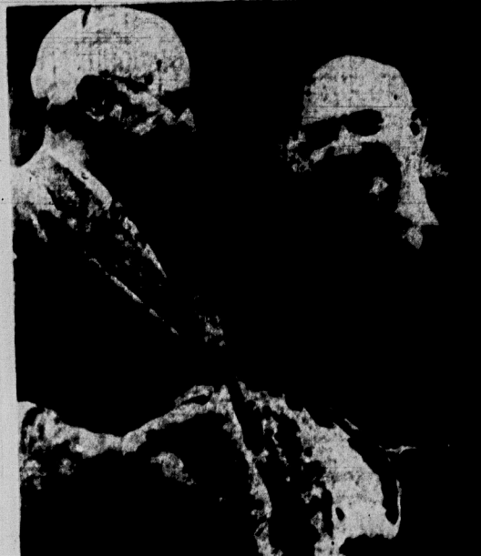
Dr. Chaim Weizmann, president of the new Jewish state of Israel, is pictured above talking with President Truman during a visit to the White House. The Chief Executive holds a Jewish scroll of laws presented to him by Dr. Weizmann when the two leaders met yesterday to discuss Palestine matters.