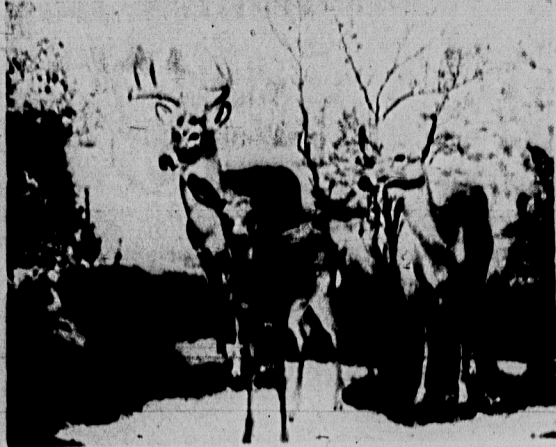
This lifelike group of Michigan deer is the latest addition to the College museum collection. It opened to public view Sunday. An open house at the same time will permit visitors to go behind museum scenes and see for themselves how such a detailed, beautifully natural piece of work is accomplished.