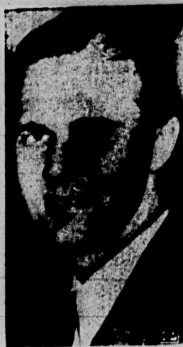
The body of George Polk, 34, American radio correspondent was found floating (May 6) in Salonika bay, Greece. Polk disappeared a week ago after telling friends he hoped to interview Markos Vafiades, leader of the Greek guerrillas, for the Columbia Broadcasting system.