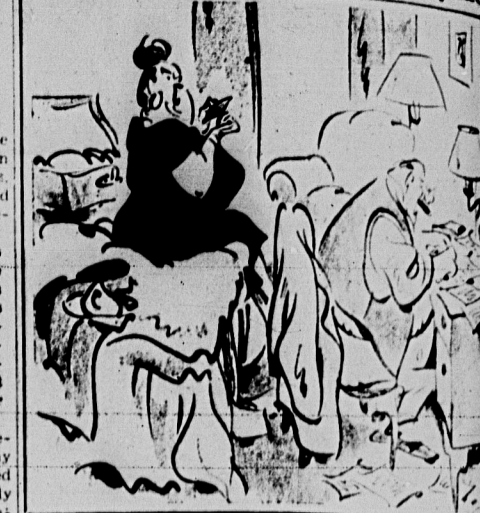
This is the last time I go along on your ways busy seeing a customer or judging.