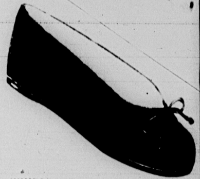
"WHIRL" Black suede ballerina flattie. 5.95