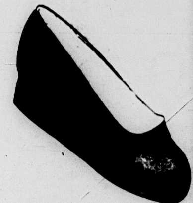
"ELEN" Grey or red suede wedge baby doll ballerina. 6.95