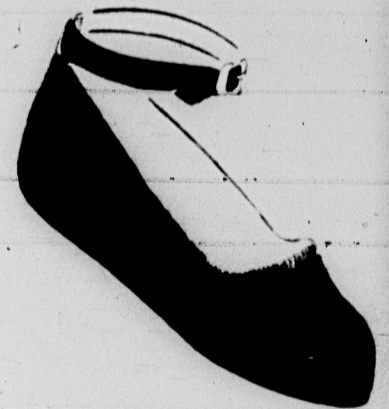
"NEW LOOK" Black suede, ankle strap lo-way ballerina favorite. 5.95