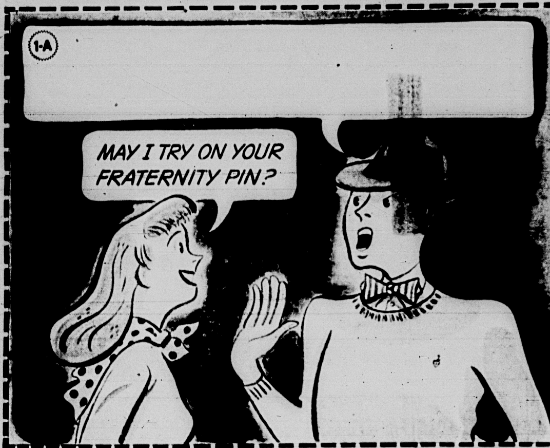
* O. K. — so she isn't the girl of your dreams! Fill in your smooth answer in the blank balloon above, using 25 words or less. Type or print answers.