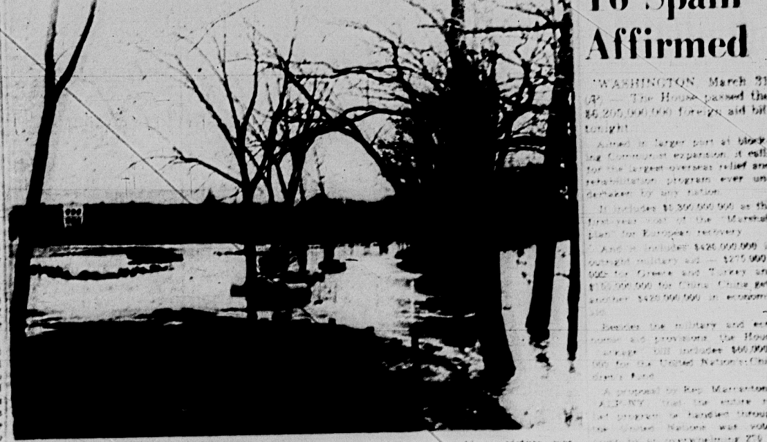
Areas of water cover the Dem hall student parking lot as the Red Cedar reaches flood stage Saturday, March 26. Flood water is seen from the foot of the railroad bridge looking toward Jackson to double second annual rampart. Above picture was taken from the foot of the railroad bridge looking toward Jackson to double.