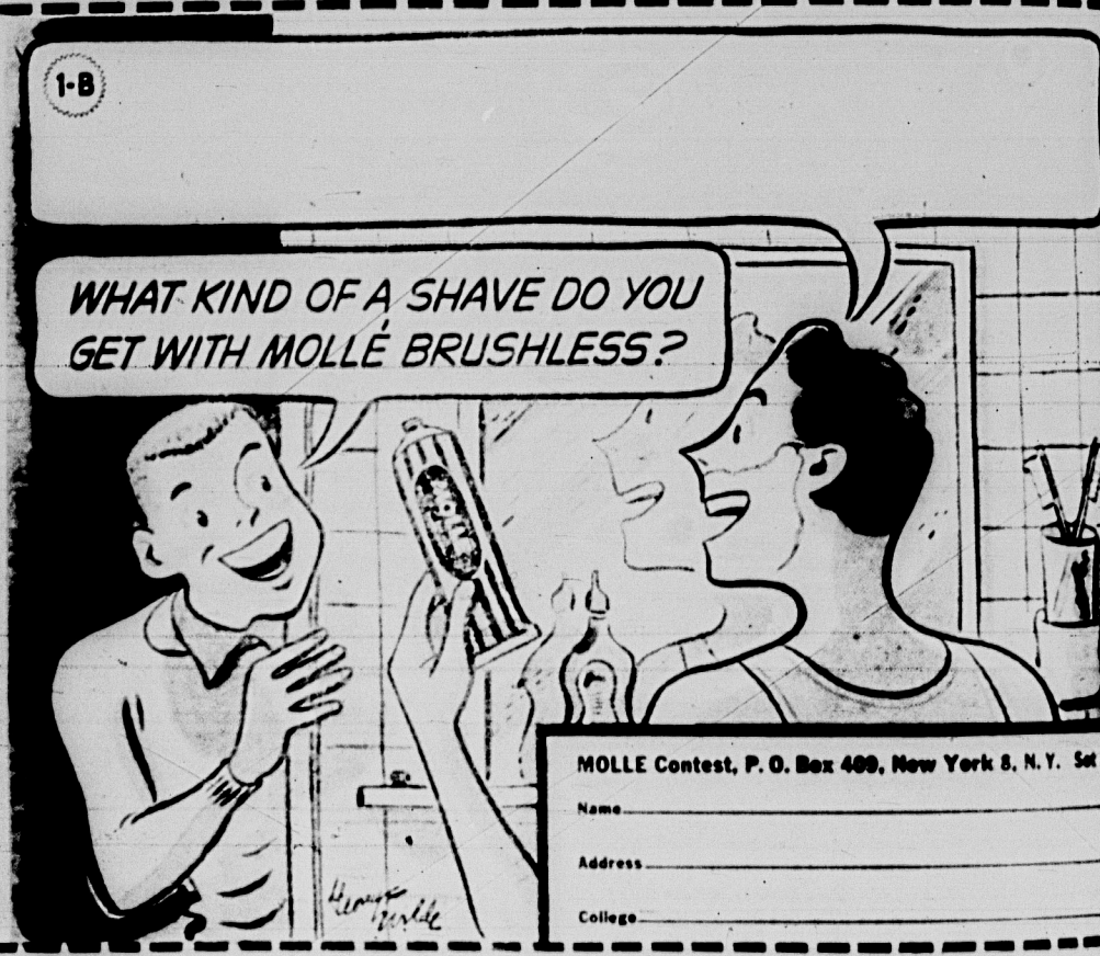
* This one is a cinch, for Molle speaks for itself. You'll find some hints in this ad! Fill in the blank balloon in 25 words or less.

MOLLE Contest, P. O. Box 409, New York 8, N. Y. Set 1