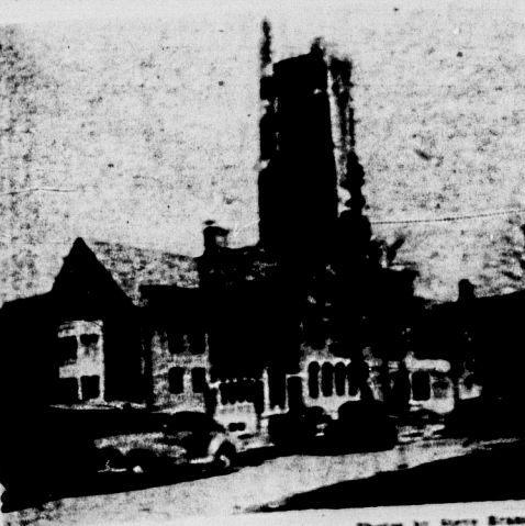
View beside the winding Grand River avenue, the casual observer casually observes the neoclassical neo-Gothic structure which has been constructed to house the college bell.

HARRY MELOTTAN The tower will be moved from the new Union Union building and placed in the attic of the new dormitory building. The State Board of Education will be broken this afternoon by the new south wing which will house a drive-in and a gift shop of products for students who are away from home.