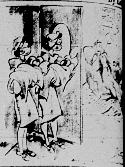
We may as well wait here...

Completion of WKAR-FM will be a factor in the success of the station. The new equipment has made it impossible to complete construction of the station.