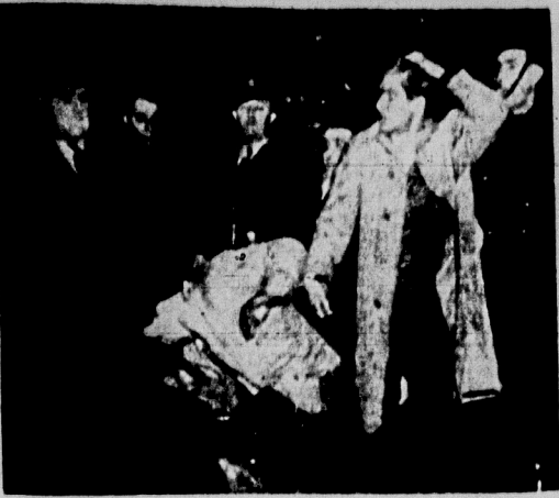
These two handcuffed men shown in Pittsburgh were captured by a small army of police after a gun battle in which two radio patrolmen were shot.