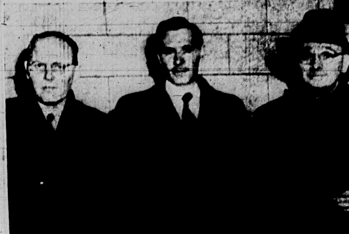
Held on Ellis Island as alleged alien communists, the three men who have been on a hunger strike appear at Federal court in New York for hearing on demand for release on bail.