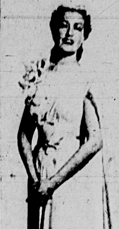
JEANNETTE MACDONALD sings tonight.

The same thing happened in an audition for a musical show. A stage hand remarked loudly, "That kid has spunk," and that prompted the producer to give her the job.