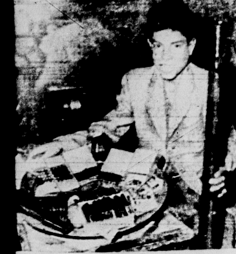
Two displays his deadly wares at his stall in Jerusalem's Old Cross. A rifle, automatic pistol, hand grenade and boxes of ammunition are among his stock. Many vendors sell such weapons.