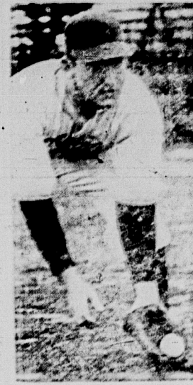
Pitcher, who was selected first baseman by the Boston Red Sox, has signed a contract with the Dodger team.

Massachusetts pitcher, who was selected first baseman by the Boston Red Sox, has signed a contract with the Dodger team.