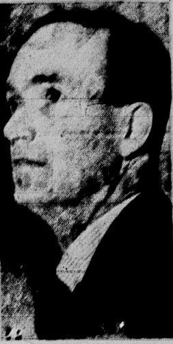
The Office Enroy has been appointed the new British ambassador to the United States.