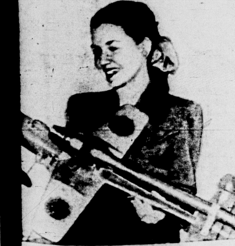
Woman holds a model plane with pulse jet-type engine made by Hamilton of Indianapolis for American Legion plane show. It follows same principle as German buzz-bombs.