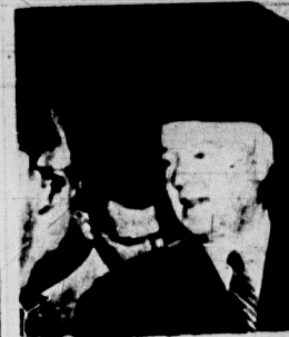
HERBERT HOOVER questions Europe...