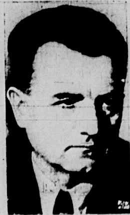
KLEMENT GOTTFWALD refused appointments.