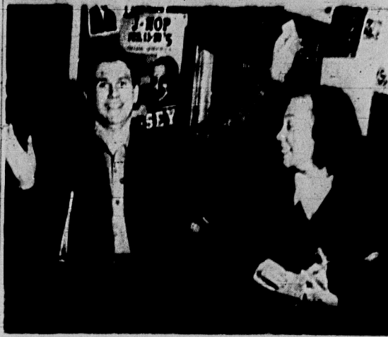
The cat swallows mouse looks as you may have guessed, being to two unidentified Sparrows who were among the last to purchase tickets for the J-Hop next weekend. The 2,000 past-boards were sold out Wednesday at 10 a.m.