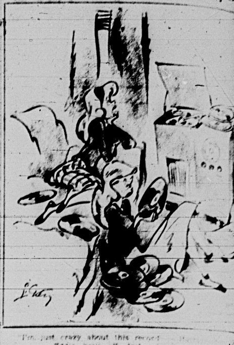
The just crazy about this record Eddie have all declared