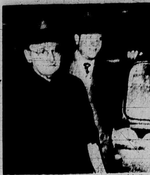
Gerhart Eisler (left), labeled by the Department of Justice as the No. 1 Communist in this country, leaves Federal court in New York, with an immigration guard. Eisler, arrested Monday on a warrant issued by immigration authorities, appeared on a writ of habeas corpus seeking his freedom on bail pending deportation hearings.