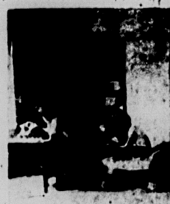
In a converted laboratory of the Institute Fisica in Bologna, a group of students have set up living quarters where they eat, sleep, and study.