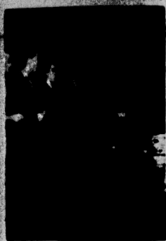
Not distributed to students.