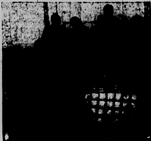
These tubercular students meet regularly in a room of their clinic in Geneva, Switzerland, where they have conferences on special subjects.